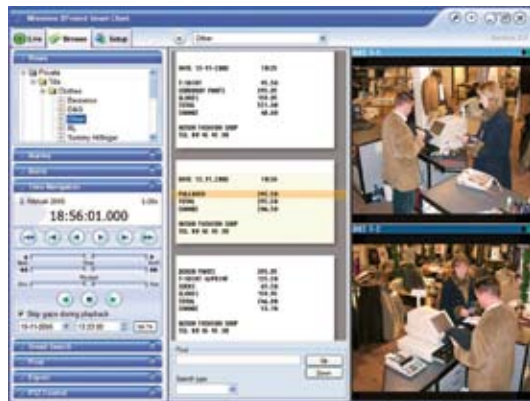
Analyzing exception receipts with high-quality video dramatically reduces time needed to investigate suspect transactions.